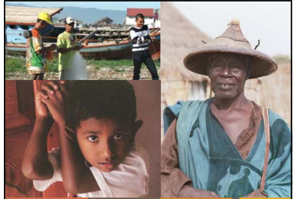
AJWS is dedicated to alleviating poverty, hunger and disease among the people of the developing world.