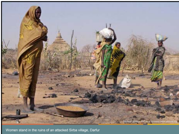
Women stand in the ruins of an attacked Sirba village, Darfur