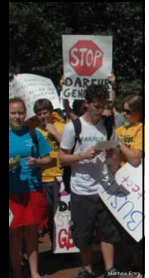
Rally participants, September 2005, Washington, D.C.